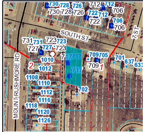
Parcel highlighted in blue