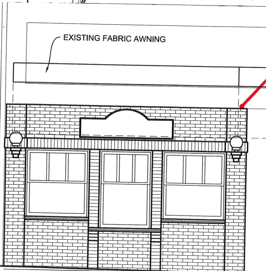
ENLARGED ELEVATION 1/4" = 1'-0"