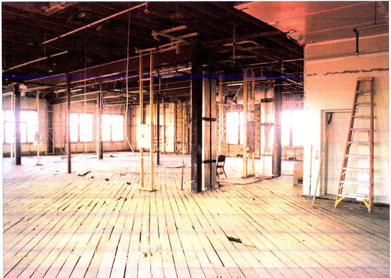
THIRD FLOOR "B"