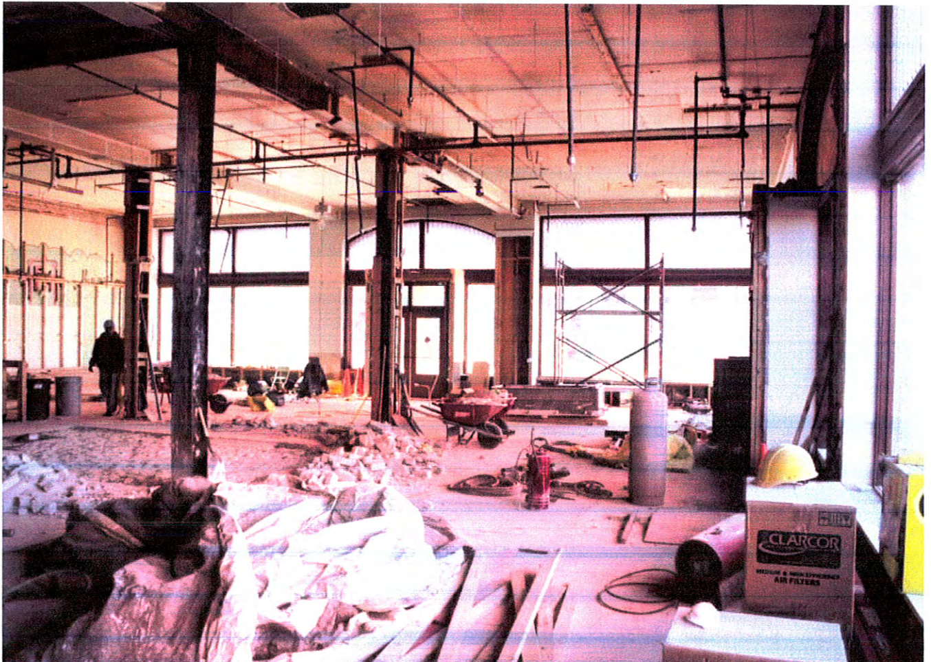
FIRST FLOOR "B"