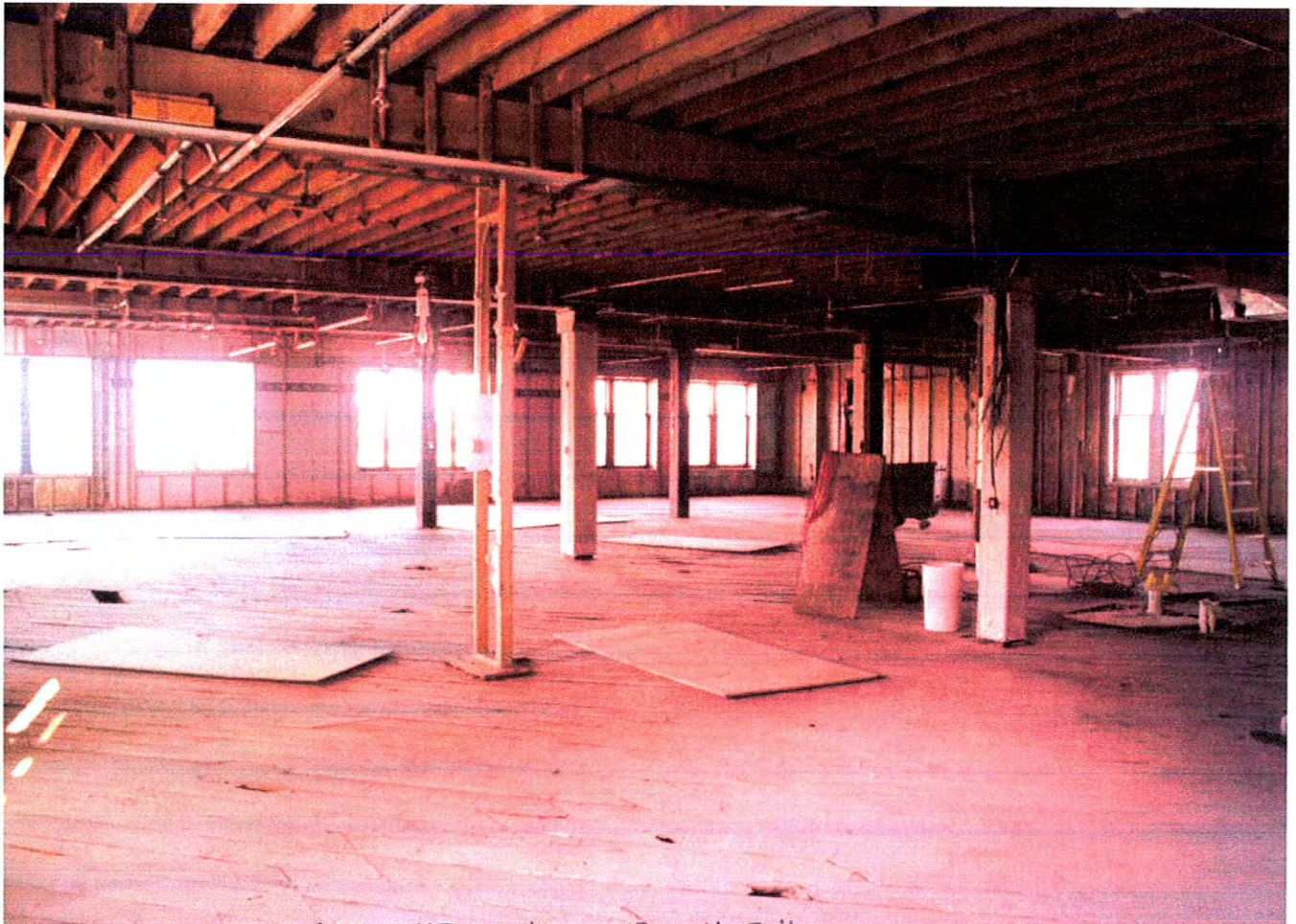
SECOND FLOOR "B"