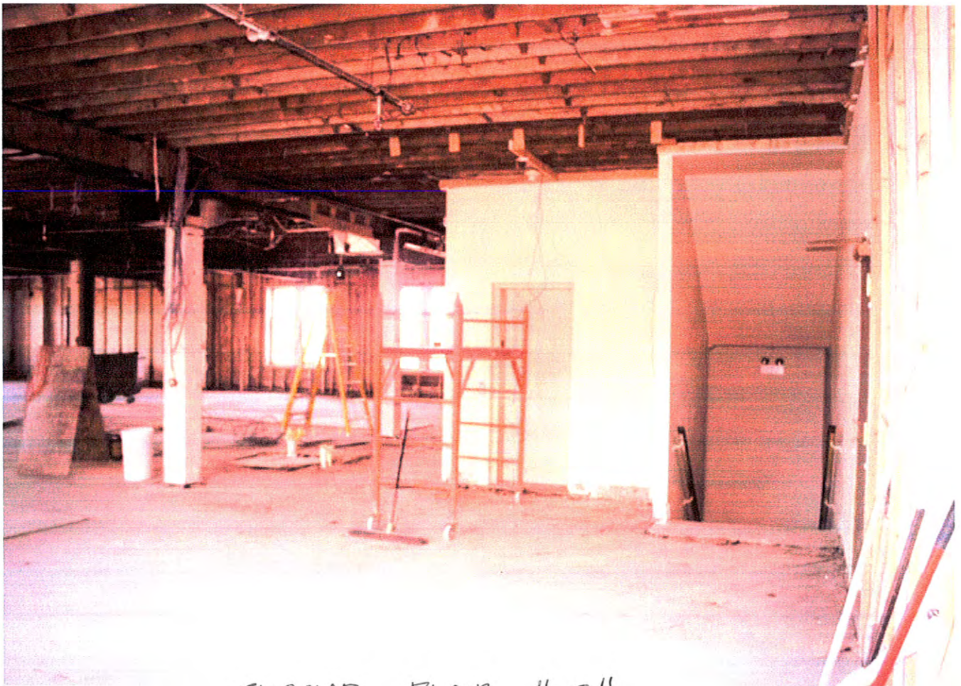
SECOND FLOOR "C"