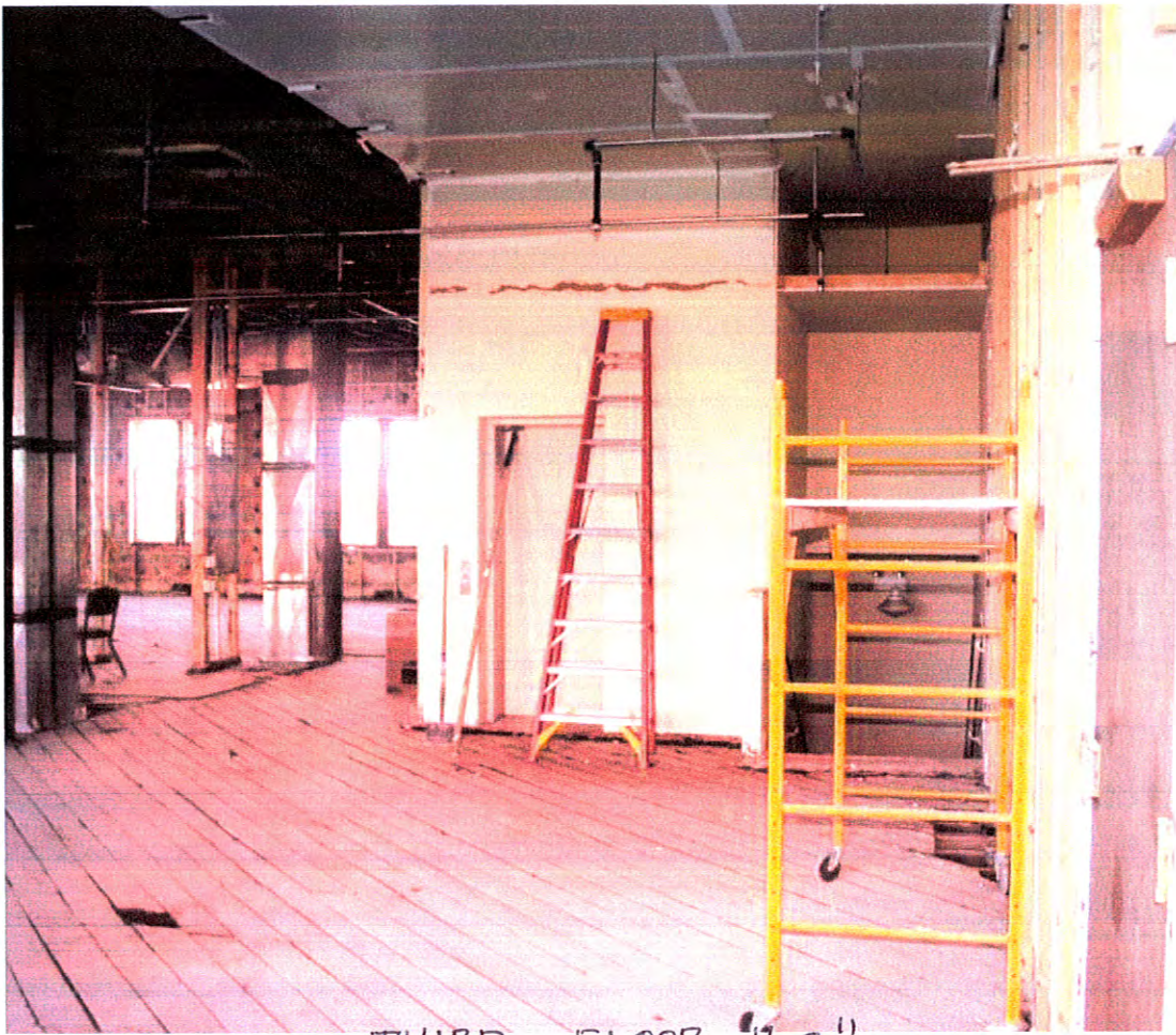
THIRD FLOOR "C"