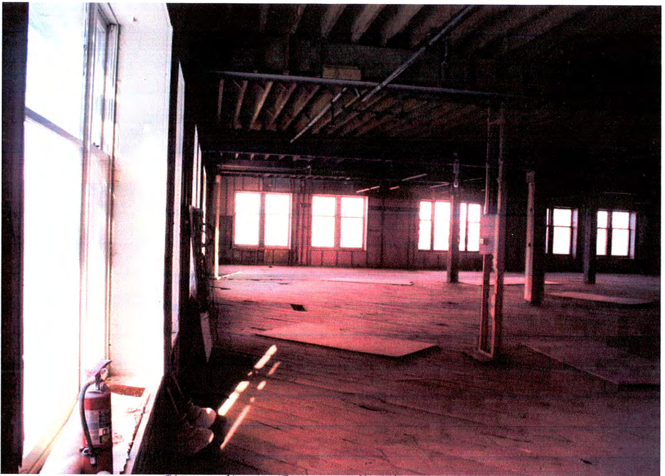
SECOND FLOOR "A"