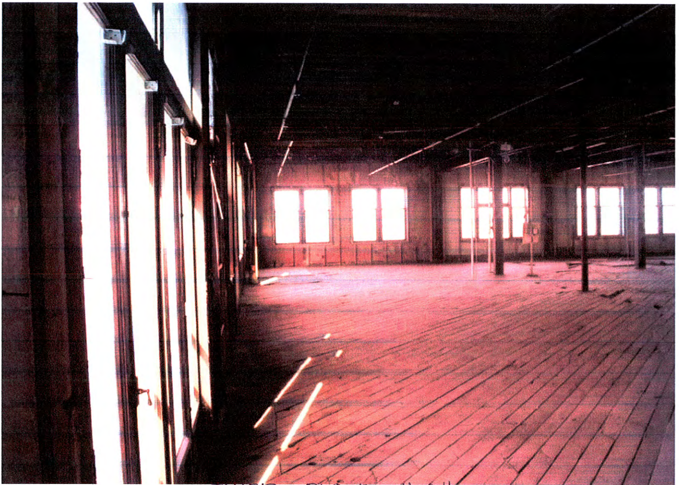
THIRD FLOOR "A"