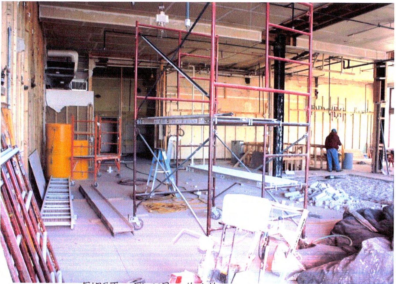
FIRST FLOOR "A"