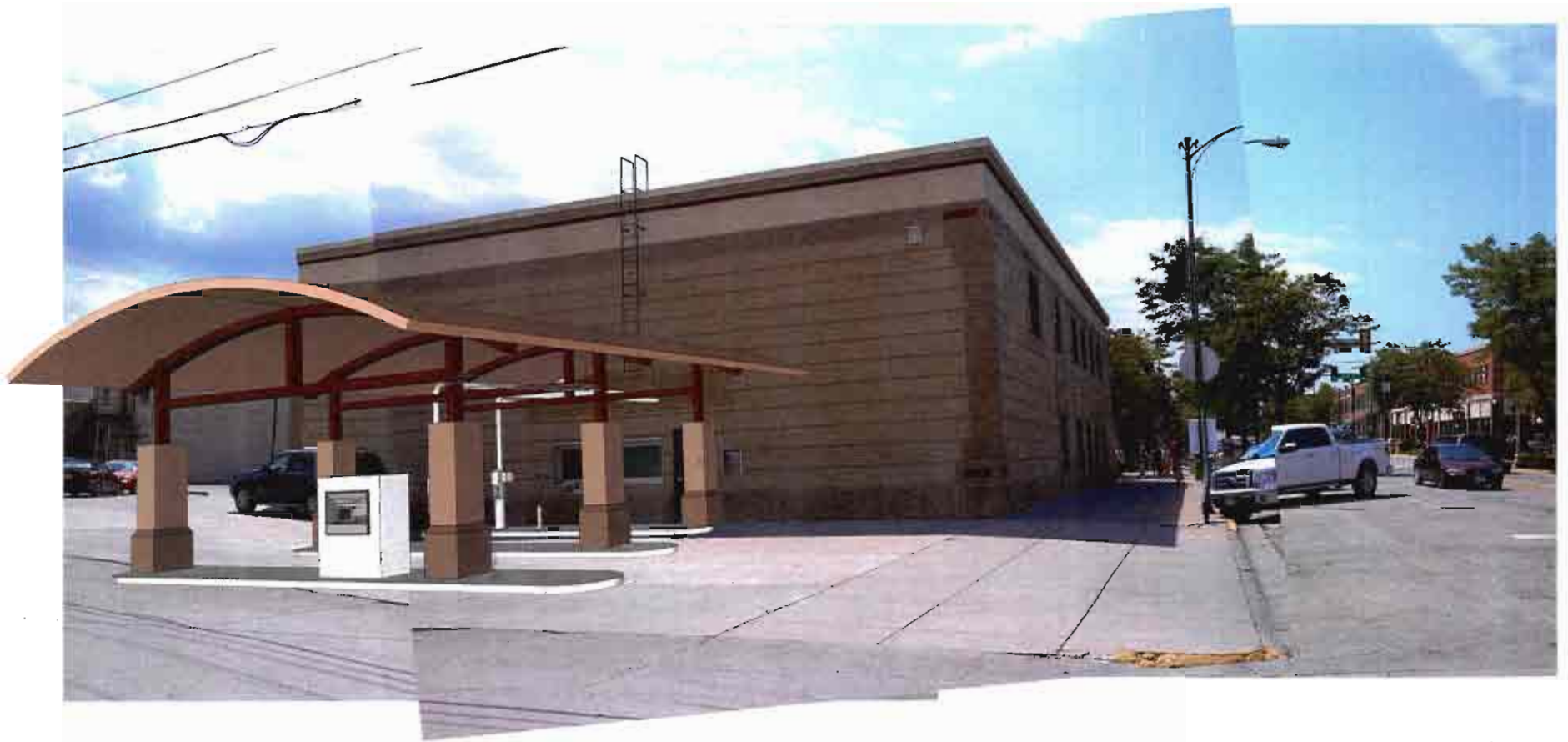
First National Bank Drive-thru canopy design :: Option 2