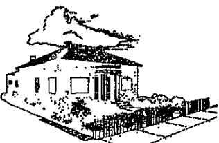
CITY HALL 1903

616 Sixth St. * Rapid City, SD 57701 * 605/721-7310 FAX: 605/721-7313 * E-MAIL: Gary@RennerAssoc.com * Spearfish 605/717-0016 *