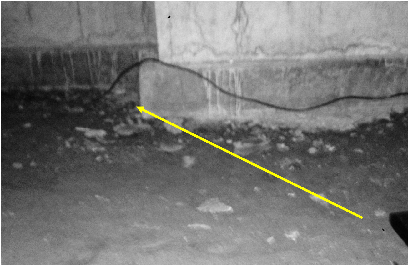
Image shows dehumidifier power cord unplugged lying on crawl space floor.

Photos Taken: 10/01/2015 @ approximately 4:30 pm