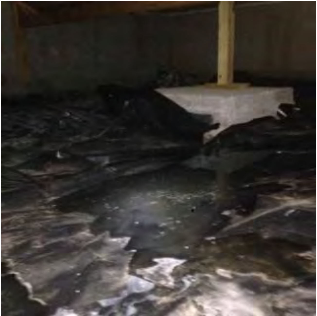
Image shows puddle of salt water from a broken water softener; not installed per Contractor

Photos Taken: 9/24/2015 @ approximately 2 pm