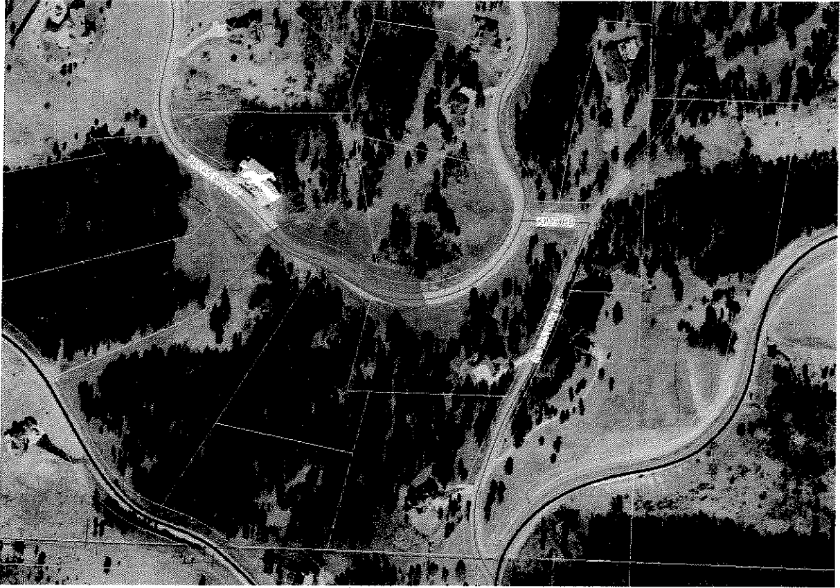
PEVANS PARKWAY SANITARY SEWER MAIN RECONSTRUCTION