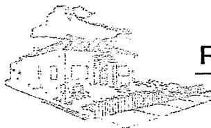
CITY HALL 1903