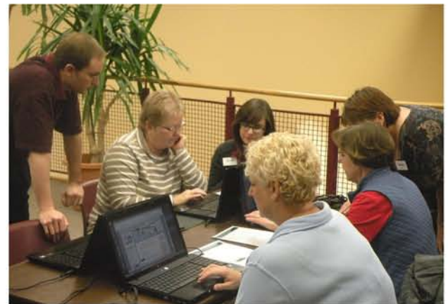
Opening of our East Branch Library on the Western Dakota Tech campus

Services added for patrons' convenience: