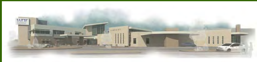
Mickelson Expansion Western Dakota Tech Rapid City, South Dakota