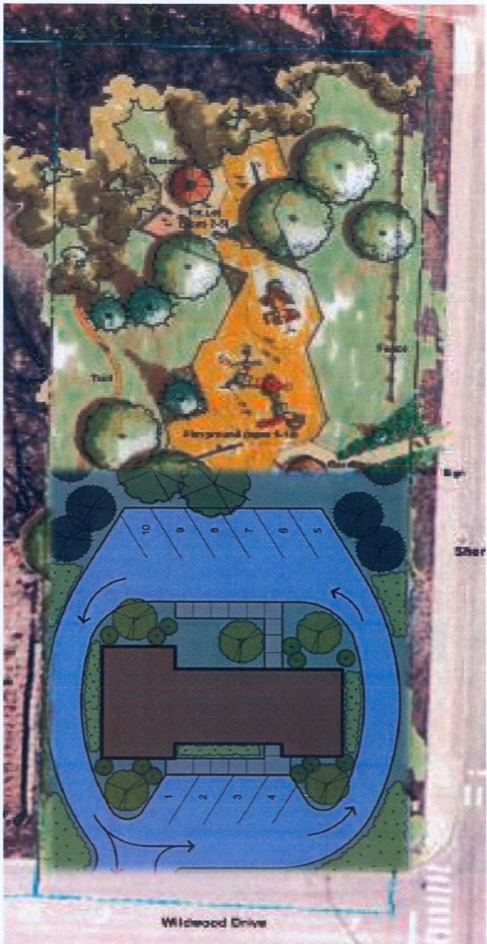
Based Upon City's Park Design Sketch - Proposed Park & Office