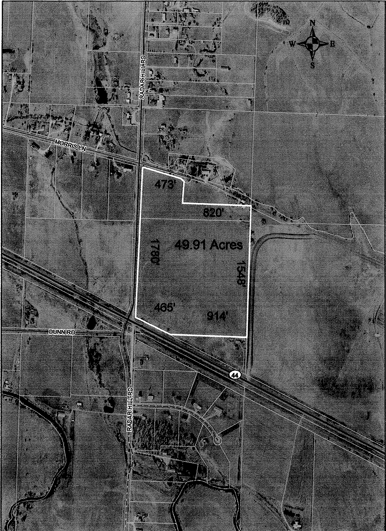
LOT B OF LOT 1