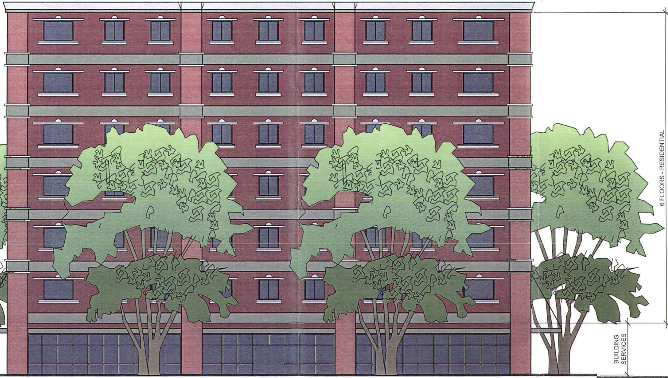
2 EAST ST. JOESPH STUDENT HOUSING BUILDING ELEVATION