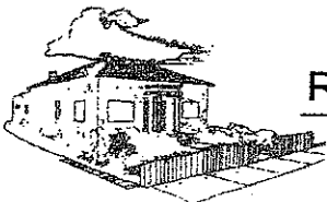
CITY HALL 1903

616 SIXTH ST. * RAPID CITY, SD 57701 PHONE: 605/721-7310 FAX: 605/721-7313 SPEARFISH OFFICE: 605/717-0016