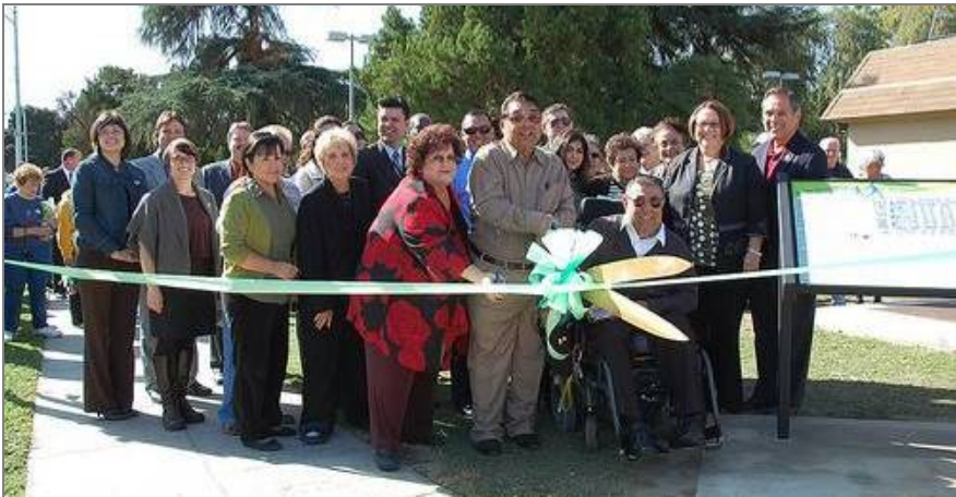
Figure 65. A launch party informs residents about a new facility and provides an opportunity for additional outreach.

When a new bicycle or pedestrian facility is built, some residents will become aware of it and use it, but others may not realize that they have improved options available to them. A launch party/campaign is a good way to inform residents about a new bike or pedestrian facility, and can also be an opportunity to share other bicycling and walking information (such as maps and brochures) and answer resident questions. It should be a media-friendly event, with elected official appearances, ribbon cuttings, and a press release that includes information about the new facility, other facilities and support services, and any timely information about bicycling or walking (such as Bicycle Friendly Community designation, an increase in bicycling or walking mode share or user counts, etc.).