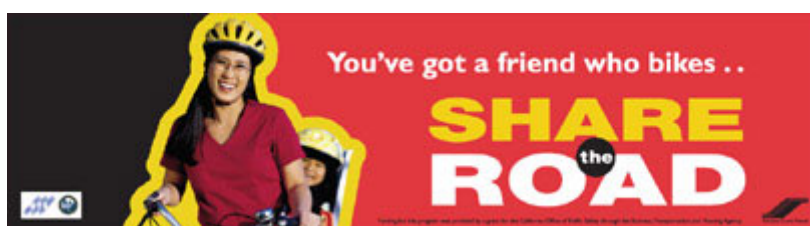
Figure 59. In order to be most effective, a safety campaign should be simple, yet memorable.

A marketing campaign that highlights bicyclist and pedestrian safety is an important part of creating awareness of bicycling and walking in Rapid City. This type of high-profile campaign is an effective way to reach the general public, highlight bicycling and walking as viable forms of transportation, and reinforce safety for all road users.