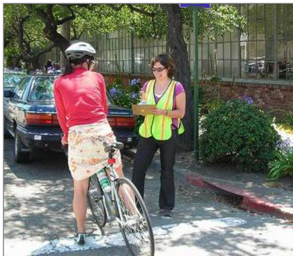
Figure 64. Conducting counts assists in planning for the future of the bicycle and pedestrian network, and provides a mechanism evaluating projects and programs.

The City of Rapid City should take the lead role in standardizing a regional approach to counts and surveys. The MPO should handle tracking, analysis, and reporting. Counts can be done manually by staff/volunteers or using video, piezometric (pressure-sensing) tubes, or infrared, radar, ultrasonic, magnetic loop technologies.