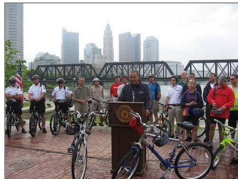
Figure 60. Bike Month activities build excitement around bicycling, and are an opportunity for novices to get support and encouragement.