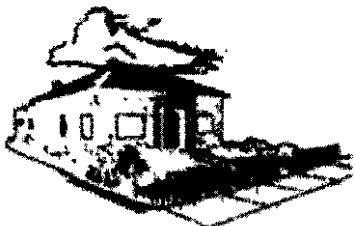
CITY HALL 1903