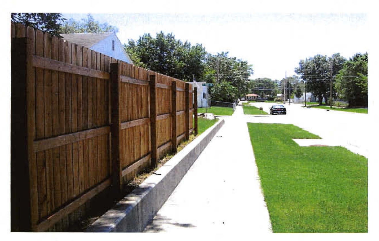
\overset{\text{Completed 6 foot fence, corner lot 802 E. Ohio Street}}{\text{CLLL}}