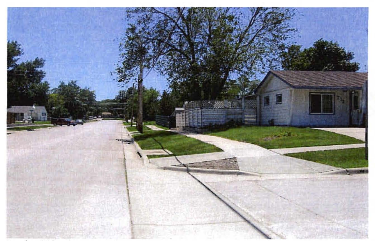
Completed 6 foot fence, corner lot 713 E. Iowa Street