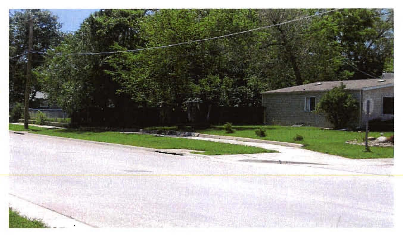
Completed 6 foot fence, corner lot at 713 E. Ohio Street