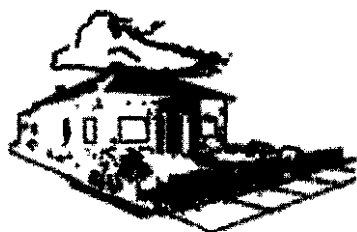
CITY HALL 1903