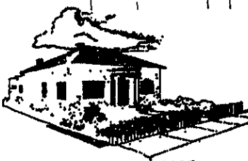
CITY HALL 1903