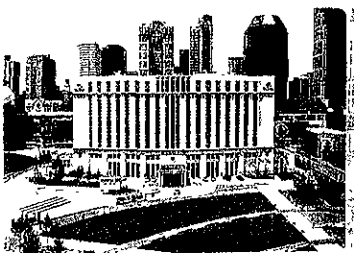
Nashville, Hilton Downtown October 16-17, 2008