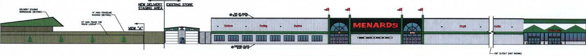
FRONT STORE ELEVATION