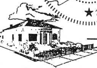
CITY HALL 1903