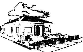
CITY HALL 1903

616 Sixth St. * Rapid City, SD 57701 * 605/721-7310 FAX: 605/721-7313 * E-MAIL: Gary@RennerAssoc.com * Spearfish 605/717-0016 *