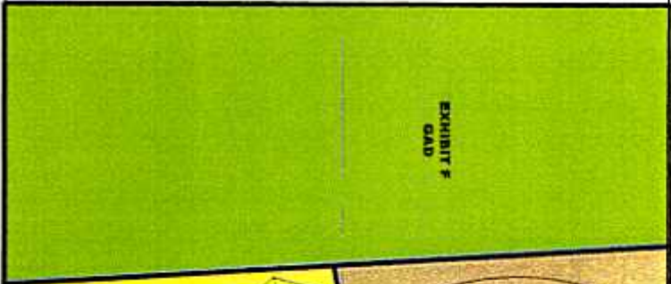
EXHIBIT F OAD