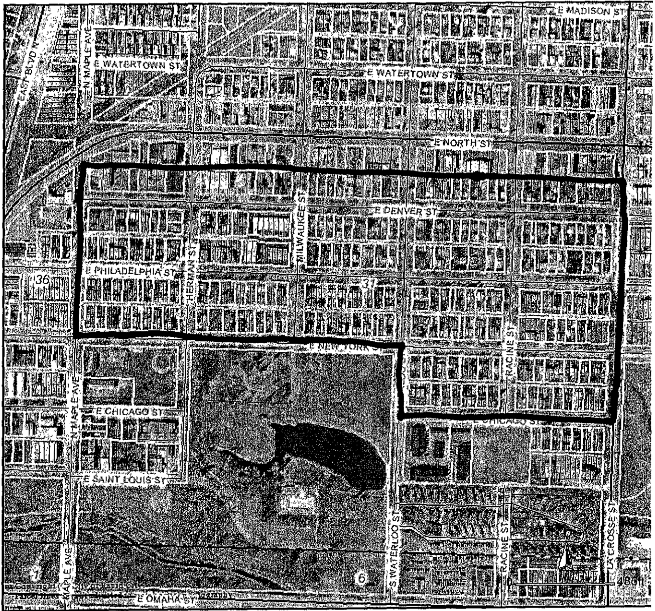
Roosevelt Park Area