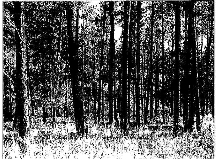
Typical heavily treed areas on site.