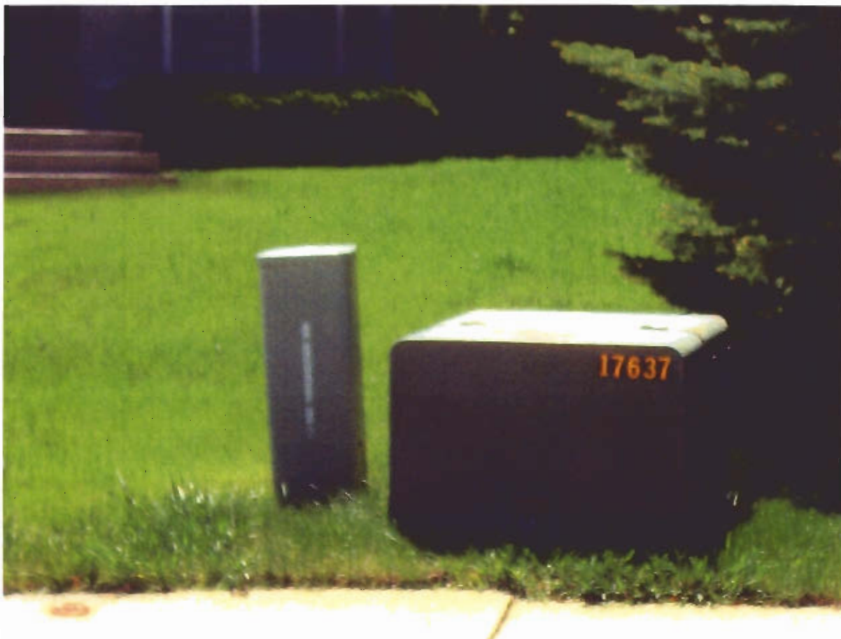
Located on Meadowbrook Court.