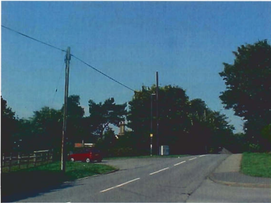
European Utility Pole Site