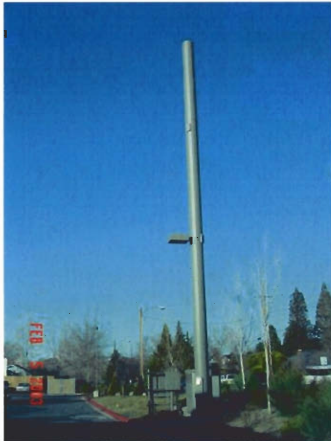
Modified Lightpole Installation in Reno, NV Residential Neighborhood