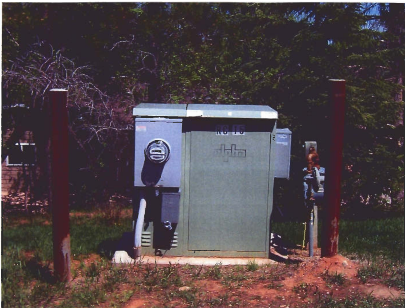
Located towards the bottom of Morningview Drive.