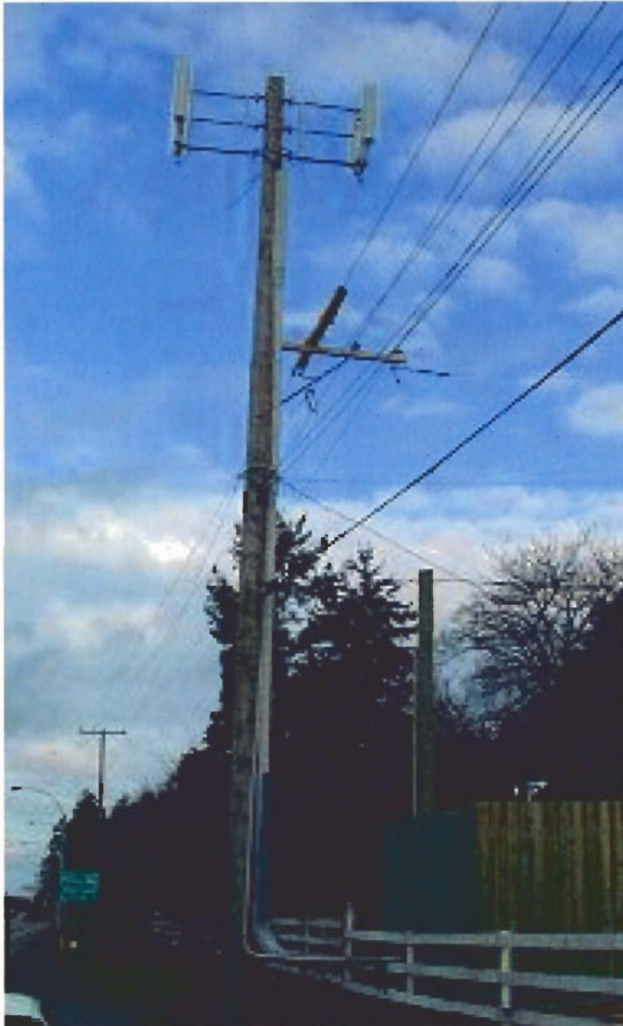
Utility Pole Mount in Canada with Shelter behind fence in adjacent yard