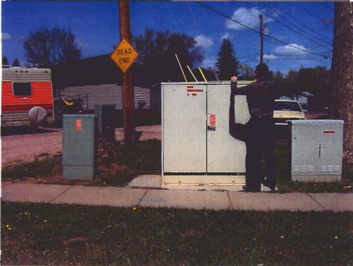
Located at 3804 Minnetonka. The largest structure is 5' high, 4'6" wide and 2' deep.