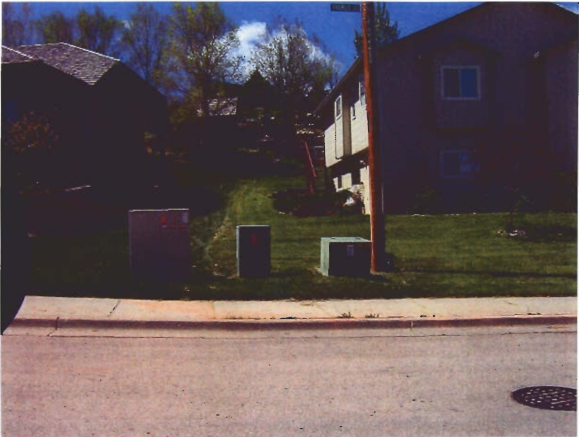
Units located across from the beginning of Player Drive.