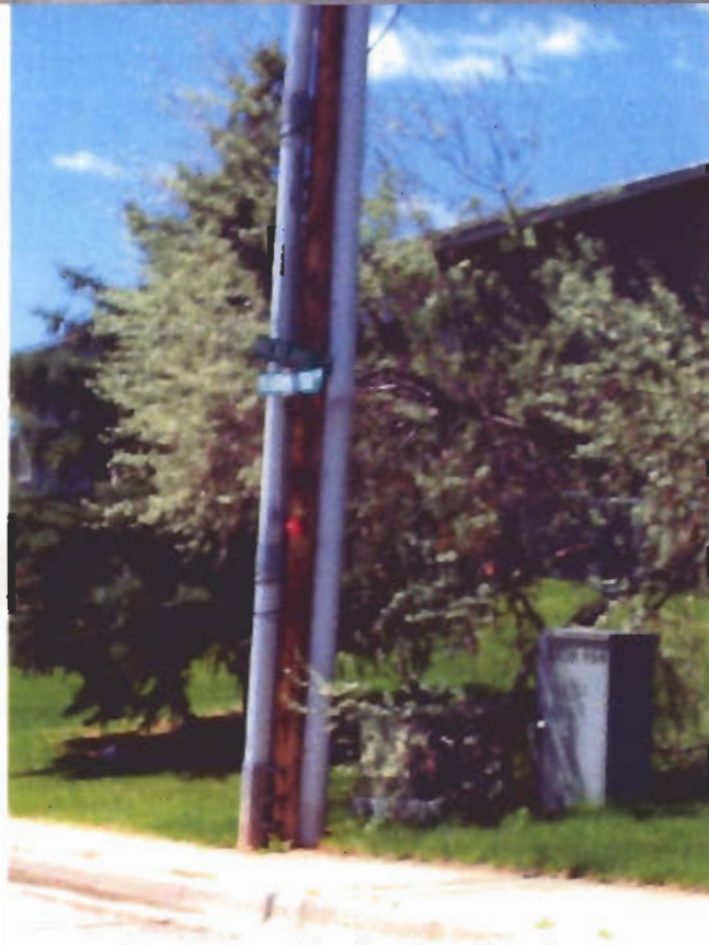
Located on Meadowbrook Drive.