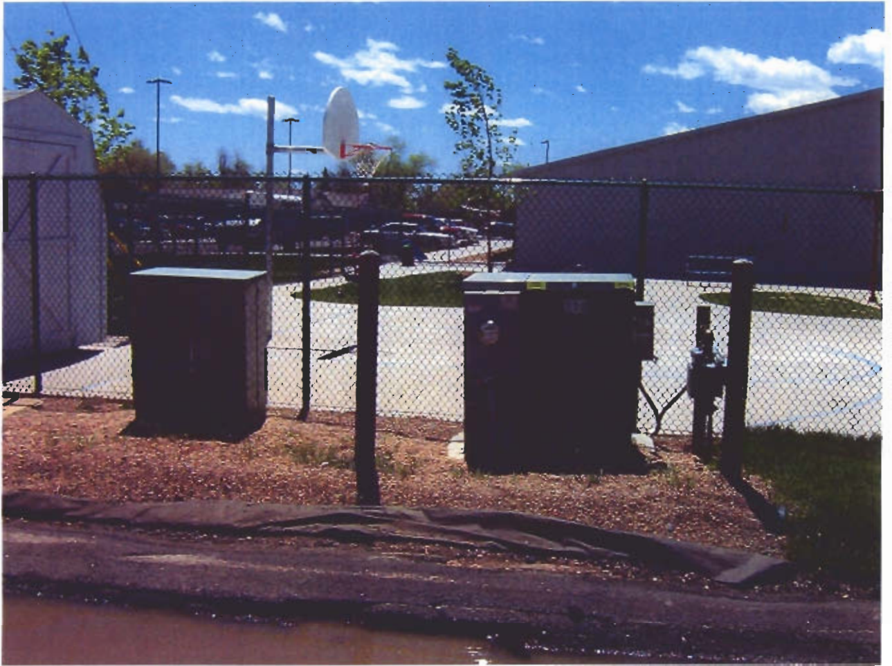
Units located behind Youth and Family Services and to the east of Food Bank.