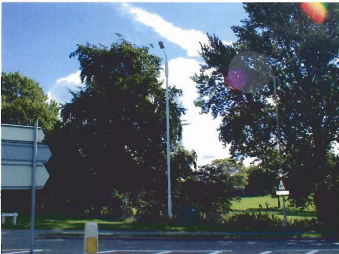
European Light Pole Site