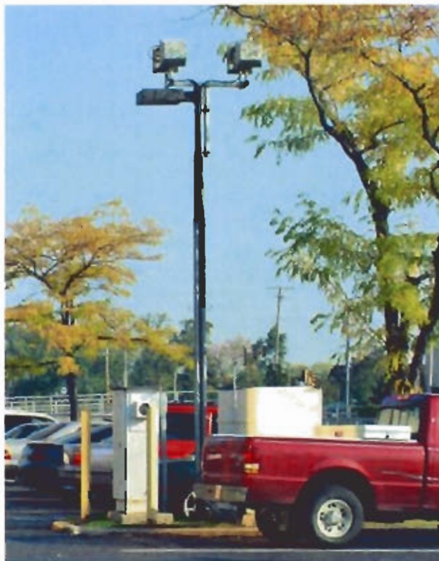
On parking lot light in Glen Ellyn, IL