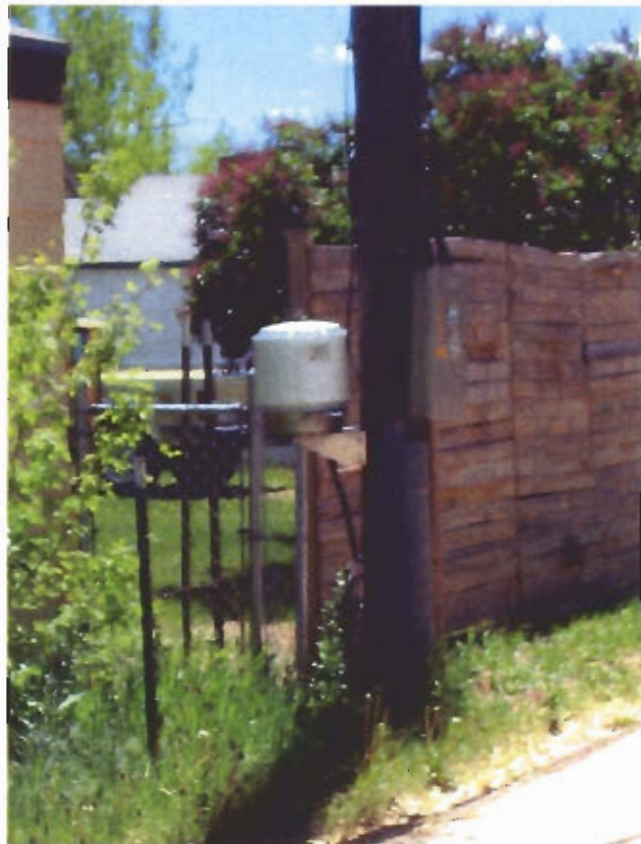
Pole located in the alley off of Adams, ½ block away from Food Bank.