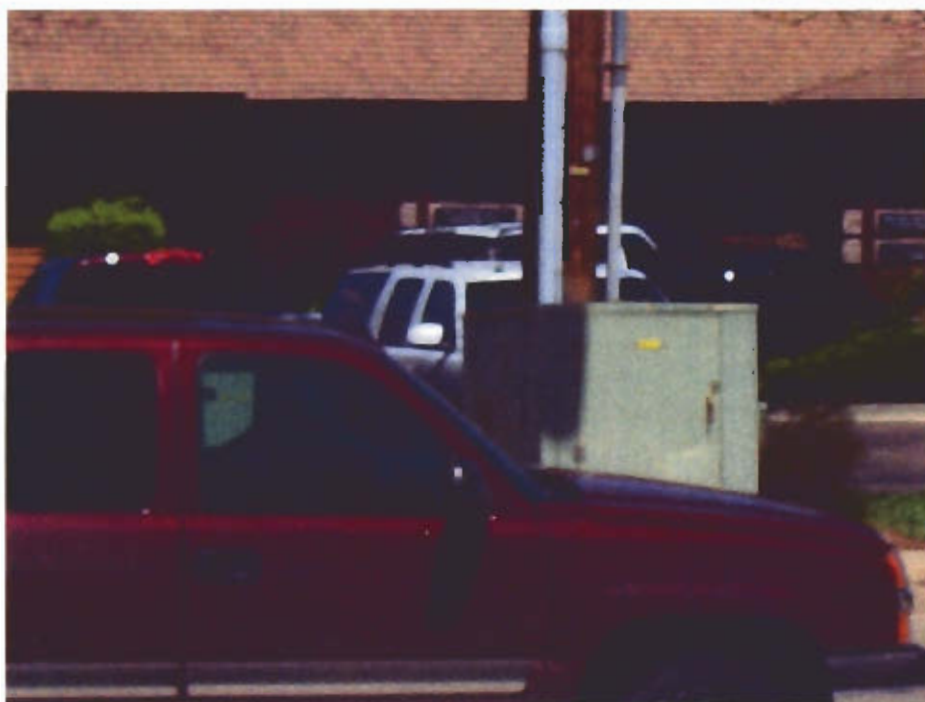
Located in front of Creekside Offices, facing Jackson Boulevard