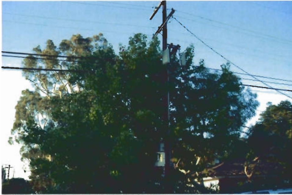
Utility Pole Installation in Palos Verdes Estates, San Diego, CA