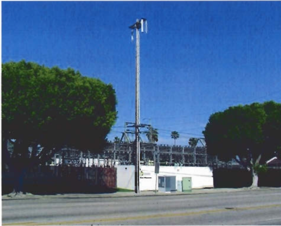
At Utility Substation in California