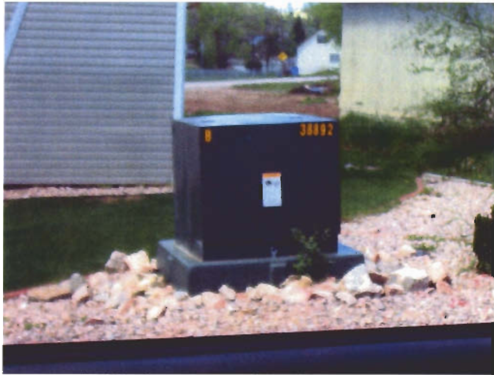
Outside of Apartments on the northeast part of town.