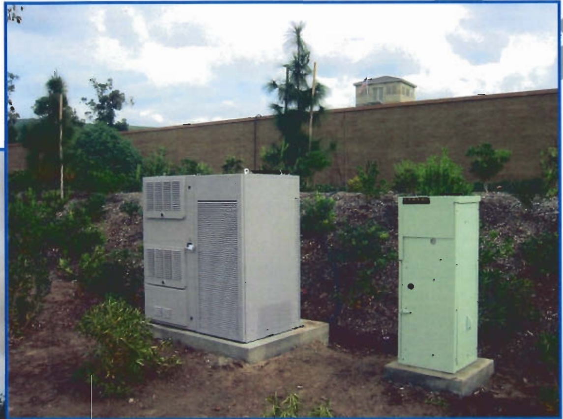
Compact Metro Cell Outdoor