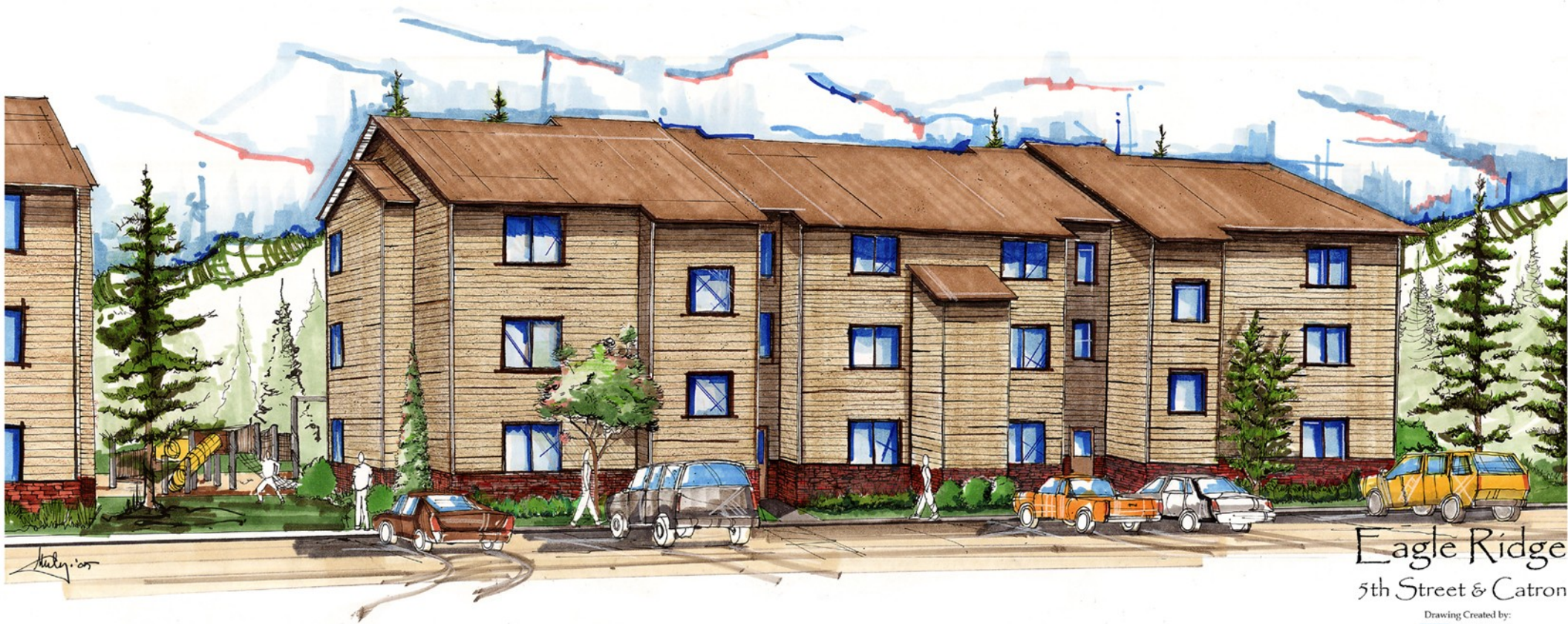
Eagle Ridge 5th Street & Catron