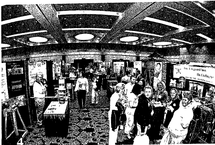
EXHIBIT HALL HOURS