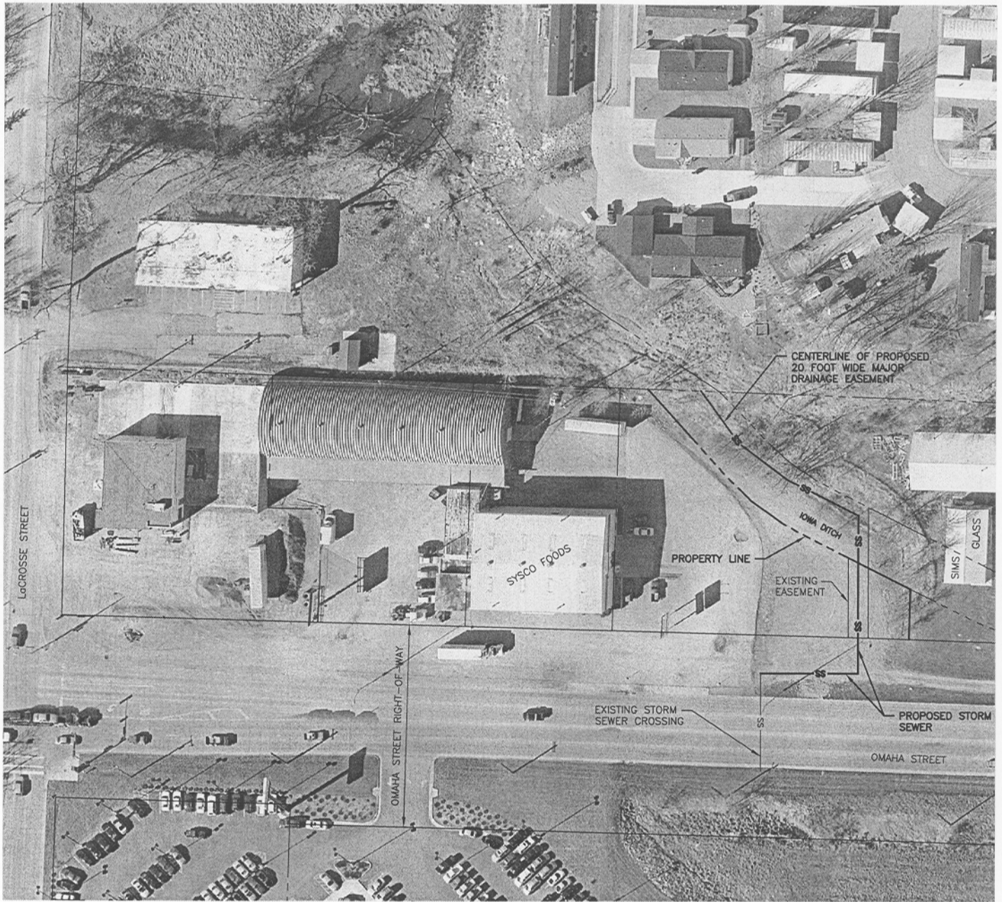
EXHIBIT A DRAINAGE EASEMENT LOCATED ON SIMS PROPERTY 720 E. OMAHA STREET DECEMBER 4, 2002

:\engring\projects\0000 Miscellaneous\dwg\0000EXBT-KNOLLWOOD.dwg, 12/04/2002 09:29:41 AM, Michael