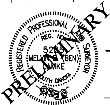
EXHIBIT 'A' VACATION OF PUBLIC ACCESS, UTILITY, AND NON-ACCESS EASEMENTS