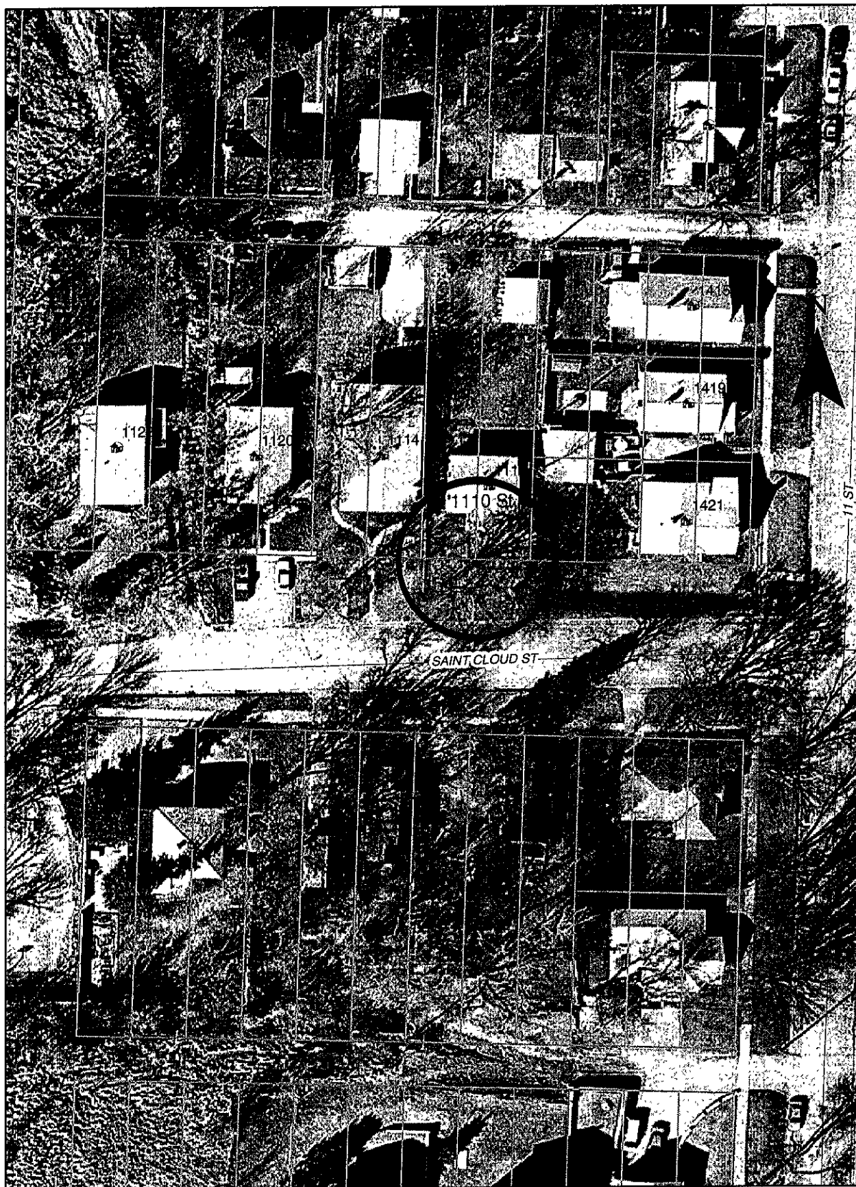
1110 St. Cloud Street